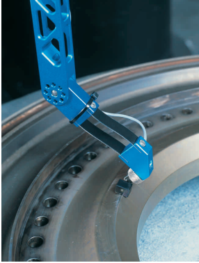
Probe connected to the robot: rifid arm/ flexible arm

Rohmann GmbH Rudolf-Diesel-Str. 13 67227 Frankenthal GERMANY Tel. +49(0)6233 - 3789-0 Fax +49(0)6233 - 3789-77 E-Mail: info@rohmann.de www.Rohmann.de